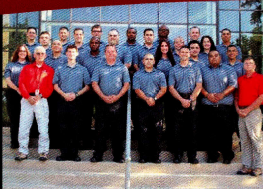
Cadets from CAPCOG Regional Law Enforcement Academy's Basic Peace Officer Class No. 67 graduate this month after eight months of rigorous training. Visit training.capcog.org for upcoming BPOC opportunities.

Her passion for working with older adults has included volunteering with organizations such as the Alzheimer's Association and participating in fundraisers to benefit seniors.