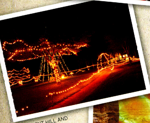
MONUMENT HILL AND KREISCHE BREWERY