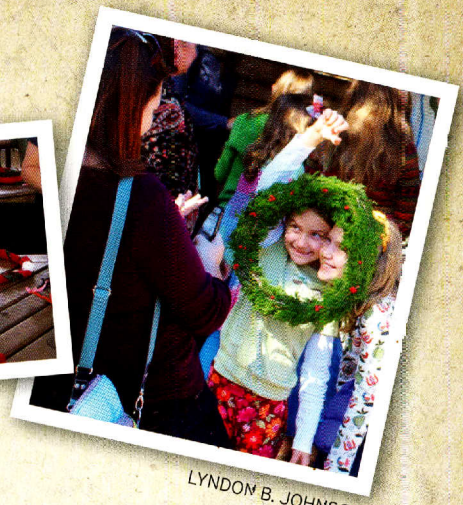
LYNDOM B. JOHNSON