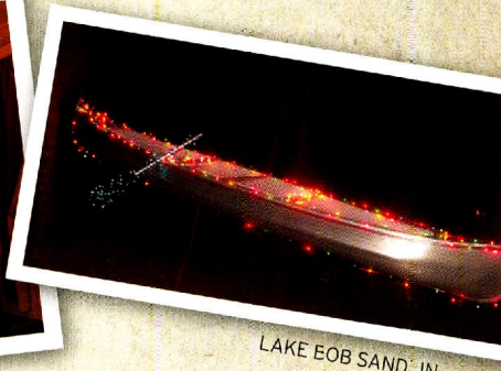
LAKE BOB SANDLIN