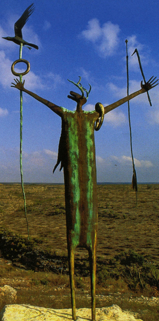
"THE MAKER OF PEACE" BY BILL WORRELL