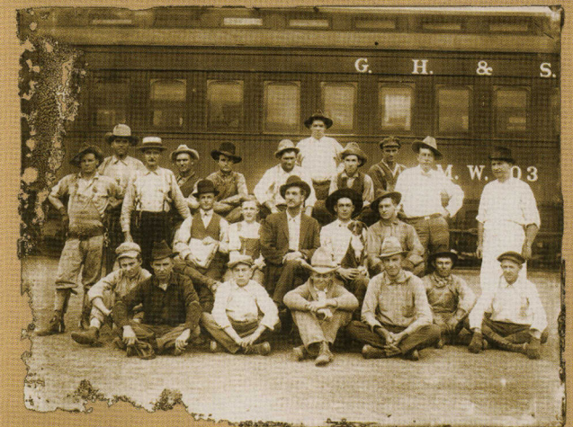
Railroad crew, 1885

With the railroad came a ranching boom. Sheep, goat and cattle producers could more easily ship livestock to markets, and the new technology of the day – barbed wire and windmills – allowed them to fence their ranches and provide all-important water for stock. Seminole Canyon was part of the Lower Pecos stock industry from the early 1880s until it became a state park in 1973. Although livestock no longer roam within park boundaries, ranching remains a vitally important activity within the area.