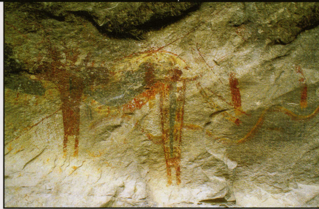
Pictographs of the Lower Pecos River Style adorn the canyon.