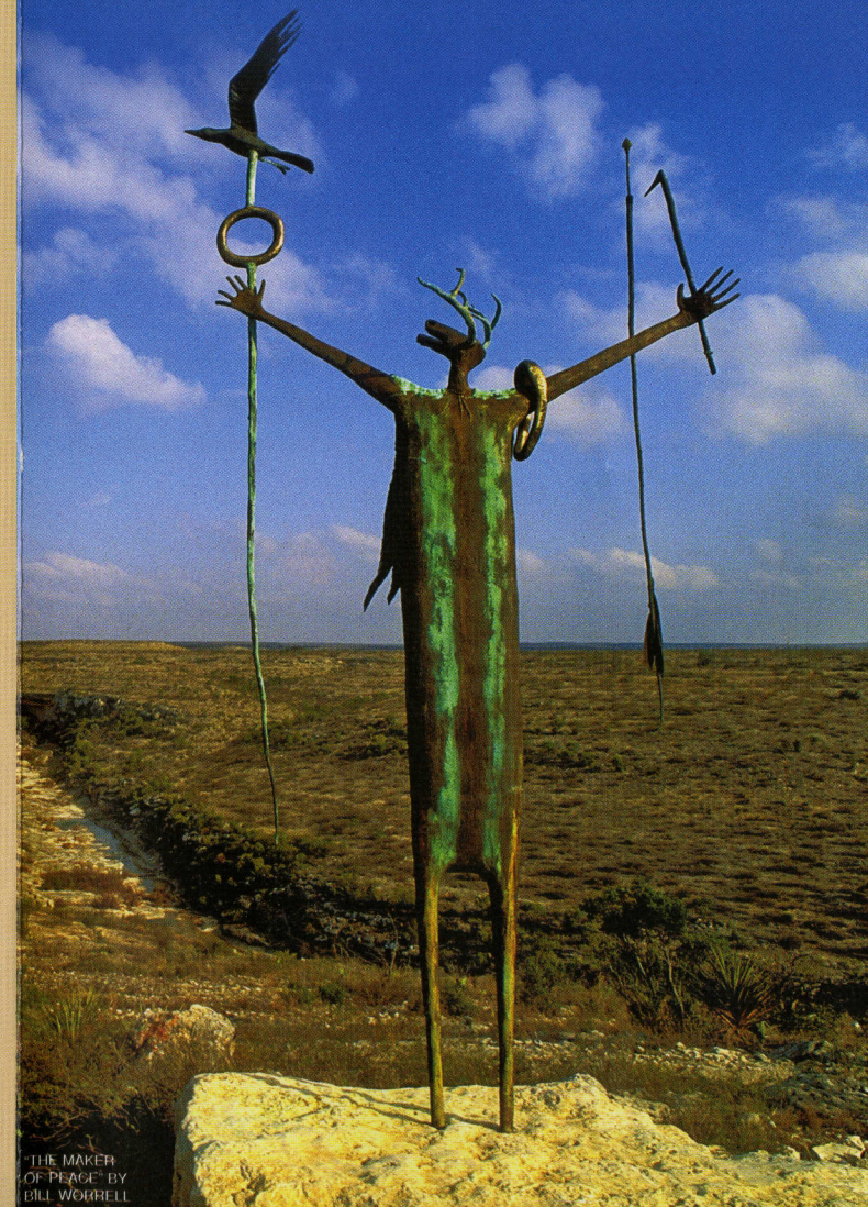
THE MAKER OF PEACE™ BY BILL WORRELL