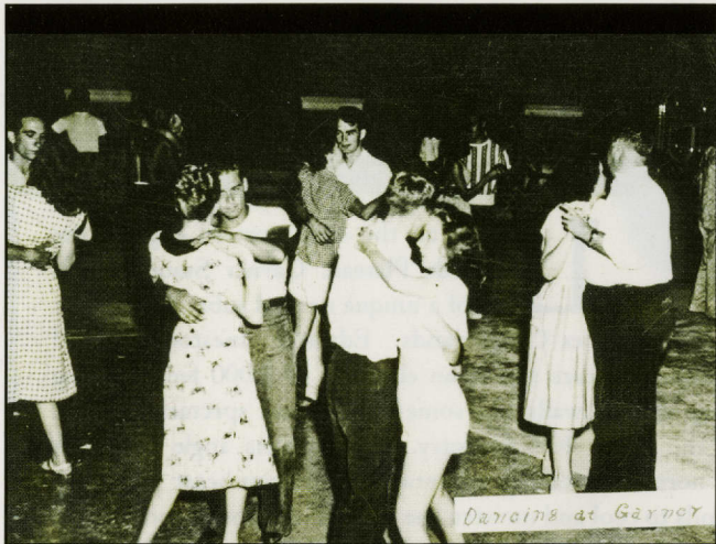
Garner boasts the only CCC-constructed dance pavilion in a state park still used for dancing.

ALIVE WITH TRADITION, SEVERAL GENERATIONS FREQUENT GARNER STATE PARK, SUSTAINING CUSTOMS UNIQUE TO THIS PLACE. THE MOST POPULAR OF THESE TRADITIONS, THE DANCE, HAS ITS ROOTS IN THE PARK'S GREAT DEPRESSION-ERA CONSTRUCTION. AN INEXPENSIVE FORM OF ENTERTAINMENT, LOCAL DANCES BECAME A POPULAR PASTIME OF THE DAY. WHEN THE PARK OPENED, LOCAL BANDS PERFORMED IN THE BEAUTIFUL NATIVE LIMESTONE AND CYPRESS DANCE PAVILION. LATER, A JUKE BOX REPLACED THE BANDS, AND THE TRADITIONAL DANCES CONTINUE TO THIS DAY.