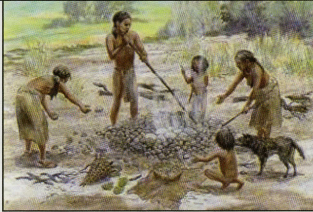
Prehistoric Native Americans built large earth ovens of heated rock for cooking roots and tubers.