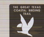
Birding Trail Sign Marker Central Texas Coast (CTC)

To aid travelers, each site is marked with a brown sign illustrated with the familiar Black Skimmer logo, as well as a unique site number that corresponds with the map. Just look for the skimmer logo on directional signs when driving along the Trail to confirm your route and location.