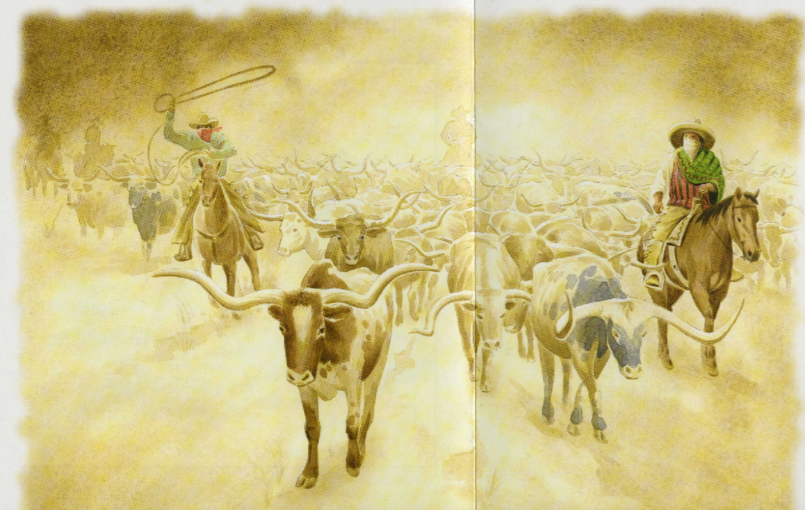
Vaqueros were the original cowboys and started herding cattle in northern Mexico in the 1590s.

Goliad County donated the site to Texas Parks and Wildlife Department in 1972. Recent preservation efforts have stabilized the mission walls. Archeological excavations provide important clues that tie construction periods to known periods of occupation. The site is open to the public by appointment only.