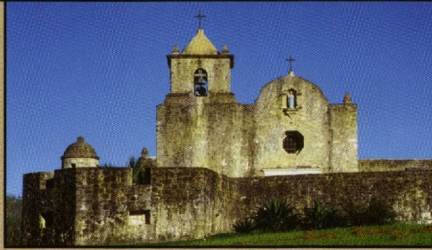
Presidio La Bahía