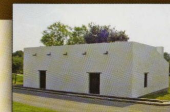
(One-quarter mile south of Goliad State Park on U.S. Highway 183, adjacent to Presidio La Bahía)

T his austere building tells the story of Ignacio Seguín Zaragoza, a Mexican hero. He was born to a military family at Presidio La Bahía in 1829 only eight years after Mexico won its independence from Spain. Thirty-three years later, Mexico was once again fighting for its independence – this time from France. Zaragoza, now a general in the Mexican army, was at the center of the struggle.