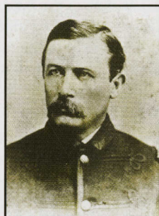
Col. Ranald S. Mackenzie

The decisive battle of the Red River War, 1874-1875, also known as the Buffalo War, was the final campaign against the Southern Plains Indians.