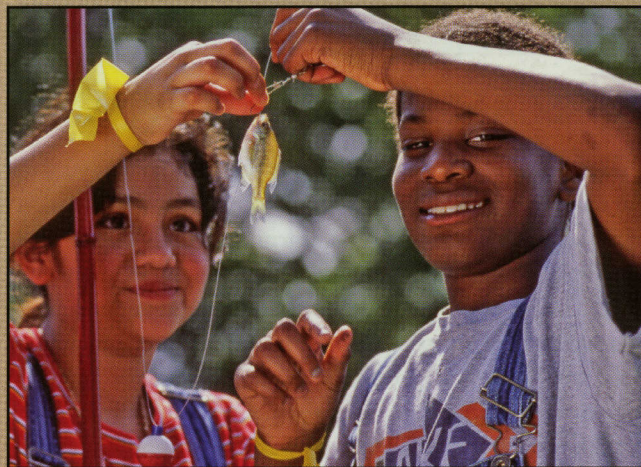
Fishing helps students discover pond ecology.

Call the learning center to schedule your school, scout or youth group for our exciting hands-on field study activities including wildlife discovery, pond ecology, fishing and alternative energy.