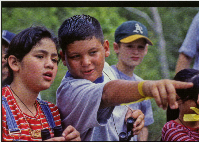
Urban youth discover the natural world at Sheldon Lake.

SHELDON LAKE STATE PARK AND ENVIRONMENTAL LEARNING CENTER IS A 3,000-ACRE HAVEN FOR WILDLIFE SURROUNDED BY THE HIGHWAYS, RAILROADS AND INDUSTRY OF HOUSTON. ITS PONDS AND WETLANDS TEEM WITH BIRDS, TURTLES, AQUATIC PLANTS AND ALLIGATORS. LAKE SHELDON PROVIDES DIVERSE WILDLIFE HABITAT WITH EXCELLENT BIRD-WATCHING, CANOEING AND FISHING OPPORTUNITIES. A FORMER FISH HATCHERY "GONE WILD" FORMS THE CORE OF A 40-ACRE NATURE LEARNING CENTER FEATURING ACCESSIBLE TRAILS, BRIDGES AND DECKS. THESE AMENITIES ENABLE SCHOOLS, YOUTH GROUPS AND CITY FOLKS TO ENJOY AN OUTDOOR EXPERIENCE CLOSE TO HOME.