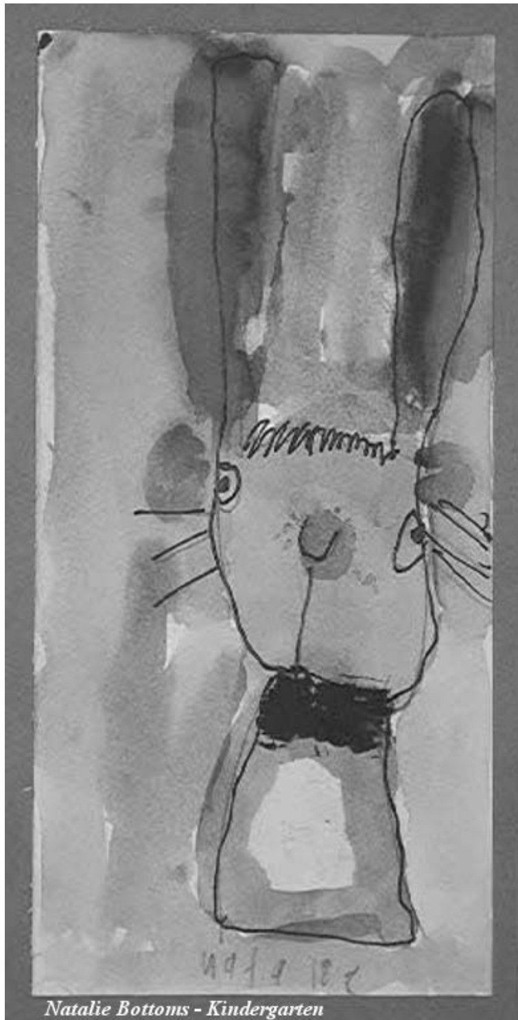
Natalie Bottoms - Kindergarten