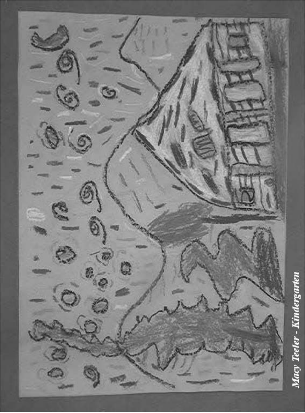
Macy Teeler - Kindergarten