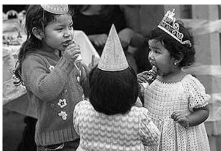
Picture, Left: Some candies from Mexico, and other countries, are made with chili and tamarind, and may contain lead.

Texas CLPPP P.O. Box 149347 Austin, TX 78714-9347