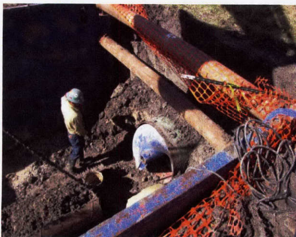
Dry bore in progress.