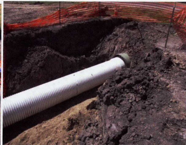
Completed dry bore with 30-inch pipe installed