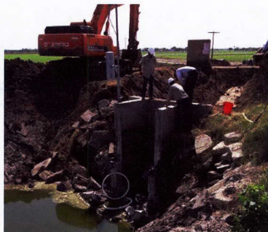
The images above show the outlet control structure from McLeod Hood Reservoir. The District replaced the gate and cut the concrete box down to allow for more flow from the reservoir.