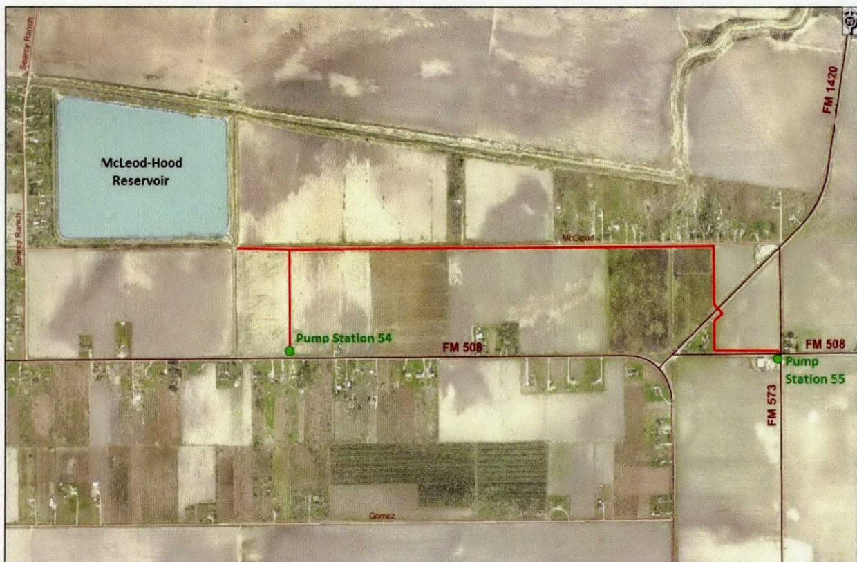
Figure 3-1. Map of project site. Red lines indicate the newly installed pipeline.

Figure 3-1 below provides a close-up of the project site and Figure 3-2 on the following page shows the project location within the District.