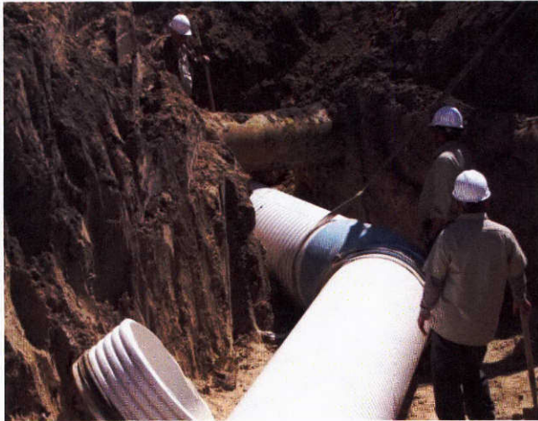
Working around a municipal water line.