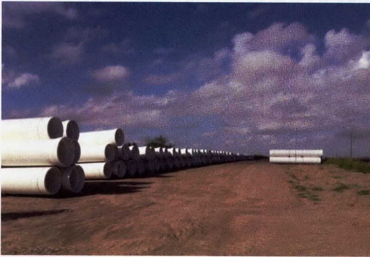
Pipe staging area.