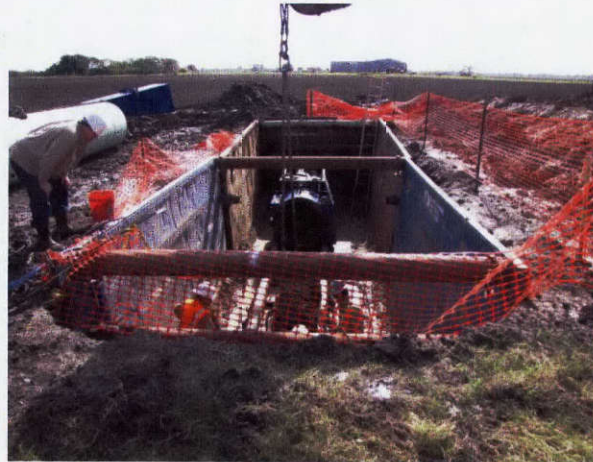
Preparing for dry bore.