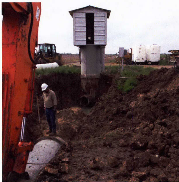
Tying into Pumping Station 55.