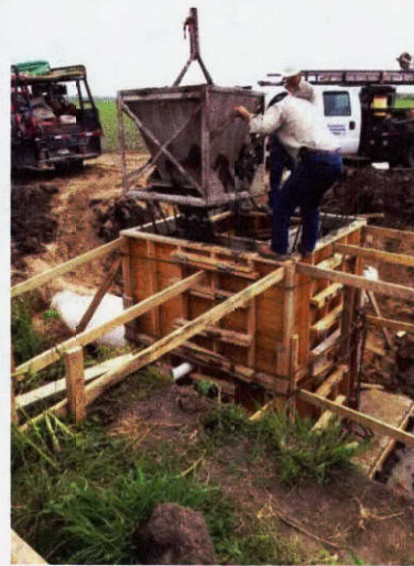
Pouring a junction box.