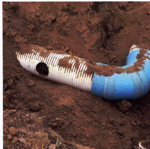
Hole for a turnout.