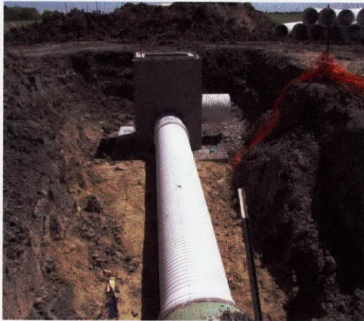
30-inch pipeline going south.