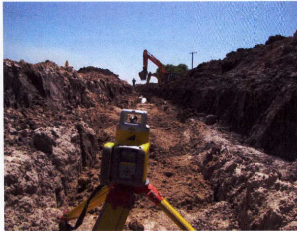
Keeping things level with a laser.