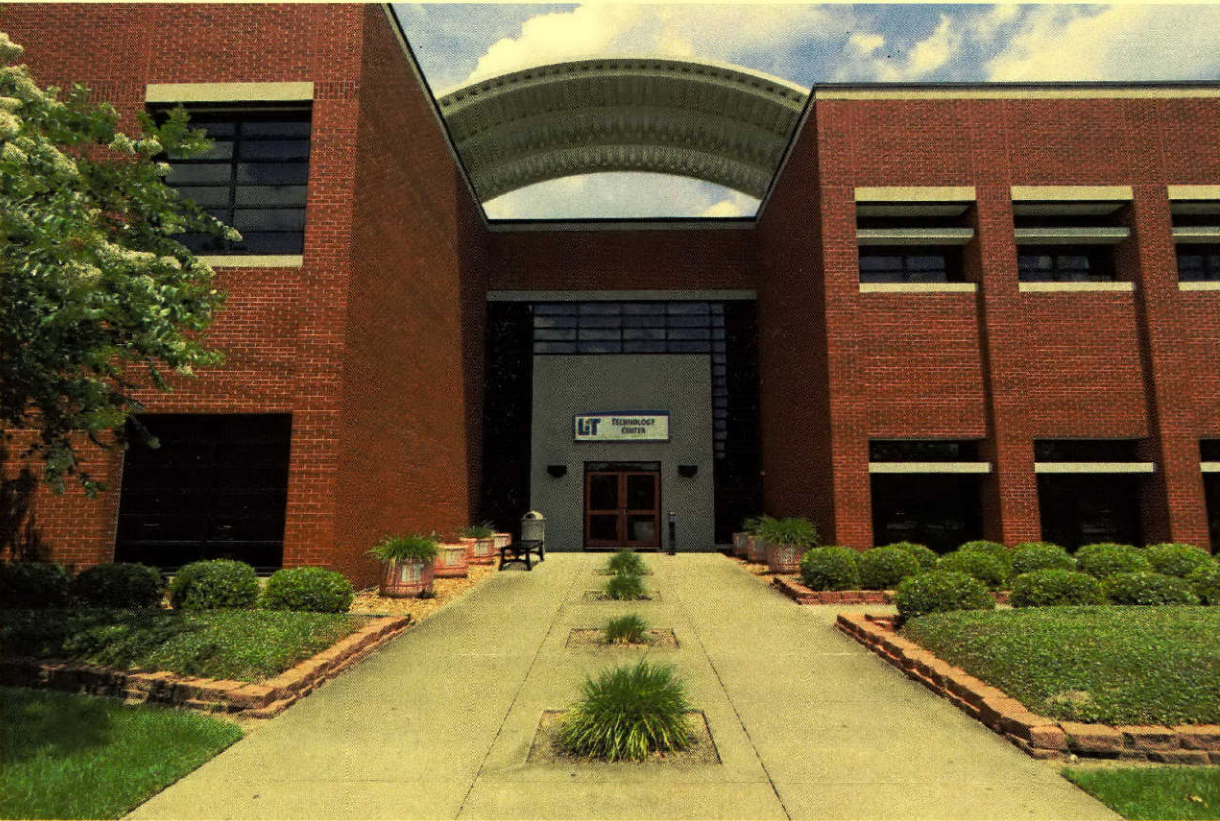
Lamar Institute of Technology - Technology Center